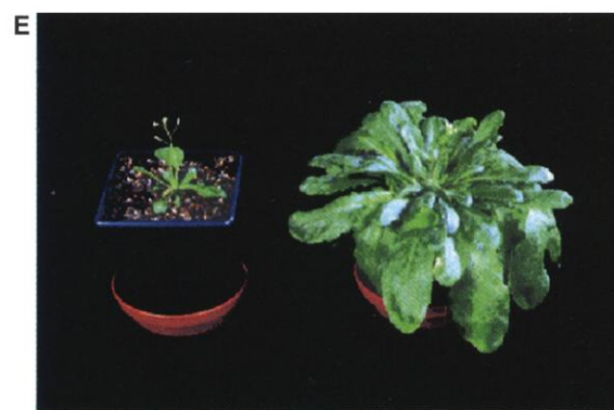
Fig. 1. Cloning of FRIGIDA . (A) Genetic interval, molecular markers, recombination positions, and yeast and bacterial artificial chromosome (YAC and BAC) clones covering FRI . Markers with mi and CC prefixes are described in (22), and those with UJ prefixes are new CAPS (cleaved amplified polymorphic sequence) markers distinguishing H51; Col DNA, 40D10, and 32F5 are H51 cosmids. Breakpoints in different recombinants are indicated at ends of horizontal arrows. IGF and TAMU BAC clones carry F and T prefixes, respectively. The different YAC clones are prefixed CIC, EW, EG, and YUP. The vertical lines and rectangles represent the extent of the region covered by the respective marker (11). (B) H51 cosmid clones covering the BAC clone F6N23. Cosmids complementing the flowering time phenotype (i.e., changing it from early to late) are shaded in red. (C) Subclones of cosmid 84M13, with complementing subclones in red. JU235 is an internal deletion of 84M13. The number of late-flowering individuals per number of transformants generated is indicated at the right. (D) Extent of deletions and rearrangements in three fast neutron-induced early-flowering mutants, FN13, FN233, and FN235 [from a population of >40 early mutants in the FRI ( Sf-2 ), FLC-Col background (9)]. Southern analysis showed that FN233 and FN235 carried intact FRI promoter regions but lacked most of the coding region of FRI . FN13 could be interpreted as having an insertion or a complex rearrangement within a 600-bp Pst I– Sac I fragment of exon 1 of FRI , internal to the Sca I fragment missing in subclone JU235. (E) Introduction of H51 FRI allele into Li5.

Wild-type Li5 is shown on the left. A late-flowering primary transformant following Agrobacterium -mediated transformation of Li5 with the cosmid 84M13 is shown on the right. Both plants were photographed once they had flowered (after ~3 months for the transformant and 3 weeks for the parent).