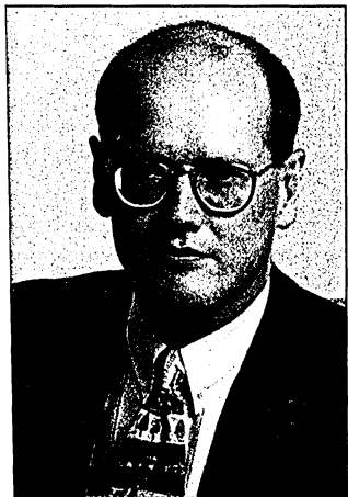
Freedom fighter? Science minister Thomas Östros says scientists will set their own research priorities.