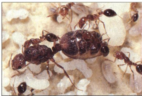
Dreaded invader. Red imported fire ants displace native ants and disrupt local ant communities.