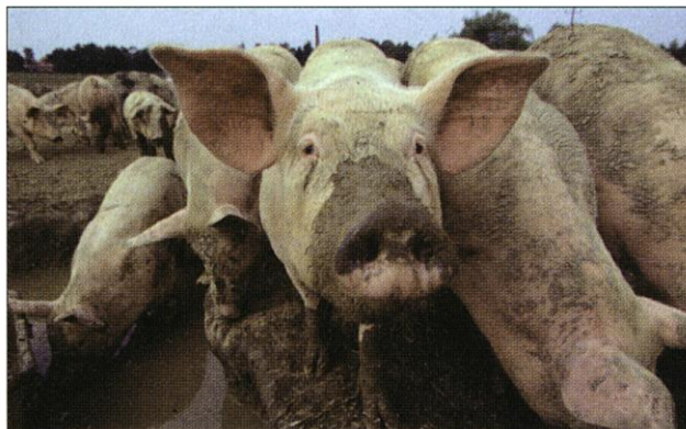
Wallowing in bacteria. After a vicious strain of drug-resistant Salmonella killed two people in Denmark in 1998, scientists traced the bug to a single herd of Danish pigs. The strain, they found, was resistant to a livestock antibiotic similar to the human drug that failed to cure the victims.