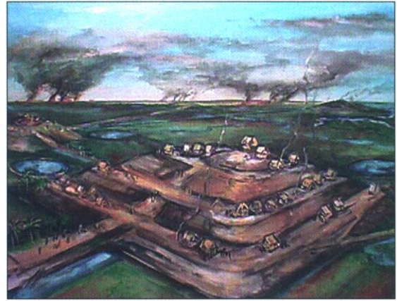
Life in the Llanos. An artist's conception of a settlement in the Llanos de Mojos, some 2 millennia ago.