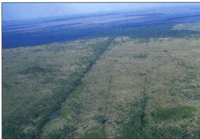
Lines in a landscape. Three pre-Columbian causeways run between raised mounds in Baures, Bolivia. Trees grow on the causeways and mounds, protected from the savanna’s seasonal fires and floods.

Although their research is incomplete and mostly still unpublished, Erickson and Balée have sketched out a rough outline of what they believe happened here. Ibibate, like most of the hundreds of lomas in the