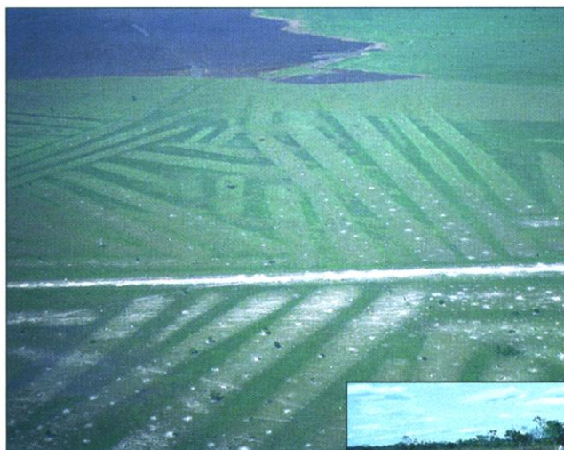
Re-creating prehistory. A patchwork of ancient raised fields (above). Clark Erickson’s team and local farmers studied how such fields work by erecting their own (right).

way to a study of the landscape as a whole—“treating the landscape like an artifact, as if it were a piece of pottery.” Such “landscape archaeology” uses nontraditional tools, including aerial photography, radar imagery, and multispectral satellite imagery, to prepare digital maps of large areas. “My main critique of the site concept is that it implicitly puts edges around each site. But here in the Beni, the ‘sites’ go on forever—