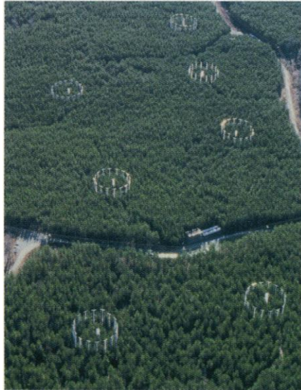
Fig. 1. Free-air CO 2 enrichment (FACE) rings in a pine plantation in North Carolina, USA. Each ring is 30 m in diameter and circumscribes about 100 trees. The distance from the single ring in the southwest (top right) to the two rings in the north (bottom) is ~500 m. The single ring in the background is a prototype. There are six experimental rings; three rings receive ambient air and three receive ambient plus 200 µl liter -1 CO 2.