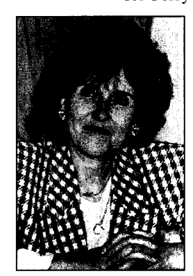
No show. EU commissioner Edith Cresson.