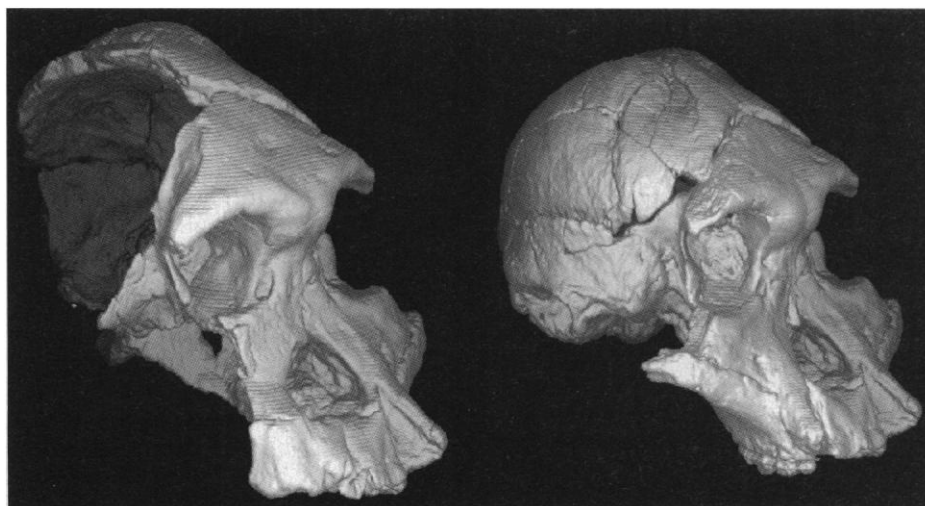
Fig. 2. (Left) computer-generated 3D reconstruction of Stw 505; (right) computer-generated 3D mirror-image model of Stw 505 with "missing" portions of the cranium reconstructed.

KNM-ER 732 suggest that these calvariae are smaller than that of Stw 505, yet published endocranial capacity estimates for these three specimens are similar to, or even larger than, the value for Stw 505 (594, 510, and 506 cm 3 , respectively). Furthermore, endocranial capacity measured by water volume in a detailed cast of another A. africanus specimen, Sts 71, shows that its endocranial capacity was probably closer to 370 cm 3 , very near the mean value for female chimpanzees, and not the currently accepted 428 cm 3 (7–10).