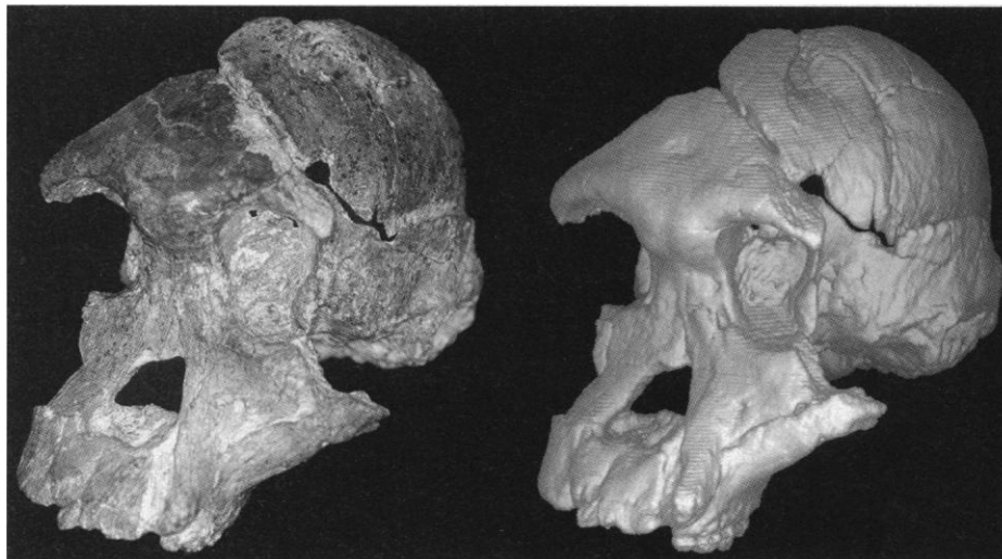
Fig. 1. Stw 505. (Left) Original specimen; (right) computer-generated 3D reconstruction from serial CT data.

We checked the accuracy of our 3D computer model by making the cranial bones transparent in order to visualize the virtual endocast. As can be seen in Fig. 3 there is no obvious incongruity between the volume-rendered cranium and its volume-rendered endocranial cavity. In other