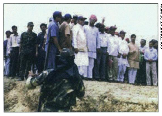
Budget explosion . Prime Minister Vajpayee visits nuclear test site after tests, which have fueled an increase in parts of the S&T budget.