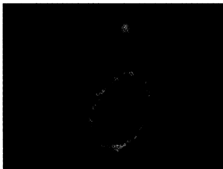
"A glowing gaseous ring seen around the tightly packed remnant of SN 1987A in August 1990, which appears as the red blob near the center of the ring. [The blue star is not associated with SN 1987A.] The photograph was taken with the European Space Agency Faint Object Camera and the Hubble Space Telescope."