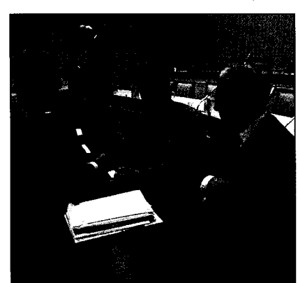
Warming trend? Rep. Rohrabacher and ozone researcher Rowland break bread.