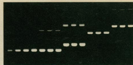
Lanes show pUC19 markers plus pUC19 with different sized inserts prepared from HB101 and JM105 strains.

The Plasmid Prep Kit contains ready-made solutions, a clean-up resin, and filters and column wells that fit the EasyPrep sample plates. Follow the standard kit protocol and you can complete up to 24 parallel preparations in about 45 minutes, each with recoveries as high as 15-20 \mu g ds DNA per 1 ml sample of overnight culture, without prior lysis.