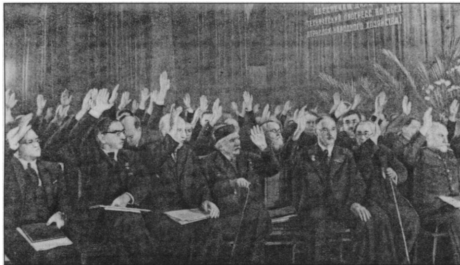
The election of V. M. Molotov to membership honoris causa in the Soviet Academy of Sciences. [Vestnik Akademii Nauk SSSR, no. 11-12, 1946]

The situation changed in the second half of the century, especially after the capitalist reforms of the 1860s. Mass media created a cult of science and the public strongly demanded new centers of learning, while the government tried to contain the spread of the political opposition that quickly took hold in the universities. A new generation of professors imported from Germany the idea that their task was not only teaching but doing research, and students and faculty struggled for autonomy. Although public demand for education for women failed to change the rules of university admission, it led to the establishment of the first private and community institutions of higher learning. By 1914 these institutions matched the