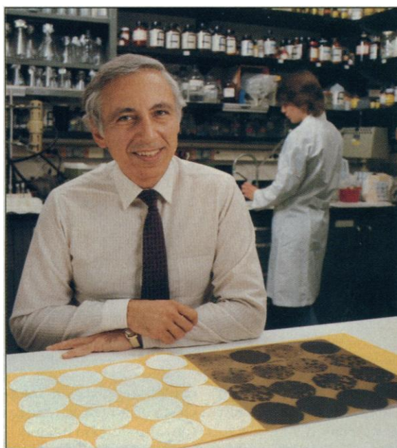
Reversal of fortune. Robert Gallo.