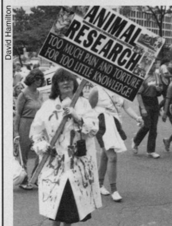
Women in the lead. At last year's demonstration in D.C.

Researchers who have been subjected to angry letters from animal activists know that the vast majority seem to come from women. Now, a Wesleyan University psychologist has provided a further glimpse into the demography of a movement that has haunted many scientists.