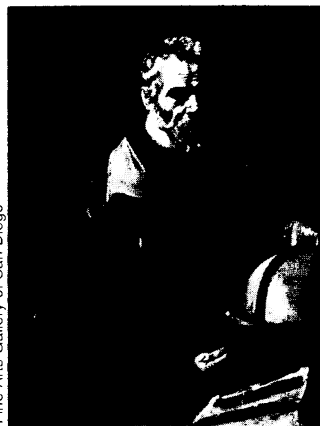
Fine Arts Gallery of San Diego