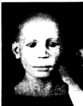
Sculptural interpretation of the head of a 7-to-9-year-old Egyptian who died around A.D. 100.