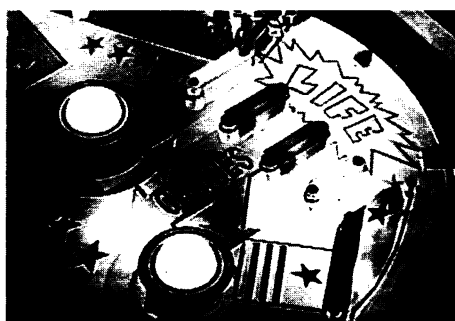
Ad For Risk Seekers. A frame from a "High Sensation Value" public service announcement, cast as a pinball game with scenes from thrill-packed activities.

Ads created by the Kentucky team will be tested in a 6-month county-wide media campaign to be conducted in 1992.