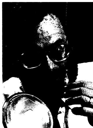
No sweat. A GE engineer examines the heat-reflective inner bulb of a halogen lamp.

Because the bulb's efficiency depends on the precision with which infrared waves are focused back on the filament, GE engineers say their new technique will work only in lights with uniform geometries, such