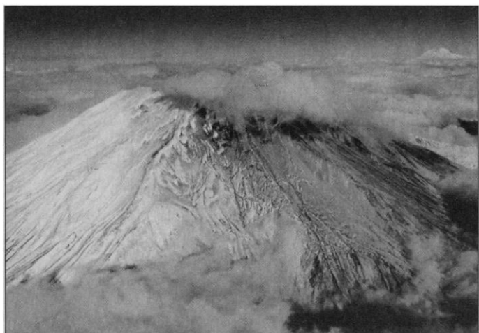
Missed this time. Mount St. Helens sports a new rim of dark ash beneath encroaching clouds after an early morning blast.

Scientists at the U.S. Geological Survey's nearby Cascades Volcano Observatory would like to be able to notify