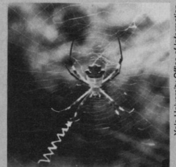
Sitting pretty. UV light reveals zigzag lines decorating spider’s web.

The UV-reflecting silks also have a second deceitful function, say the researchers, who reported their findings in the April issue of Ecology . Because sun and sky are the only natural sources of UV light, the webs also attract bugs that are trying to head for open space.