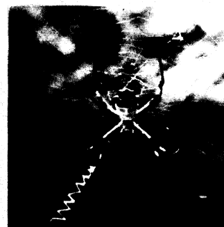
Yale University Office of Information

The UV-reflecting silks also have a second deceitful function, say the researchers, who reported their findings in the April issue of Ecology . Because sun and sky are the only natural sources of UV light, the webs also attract bugs that are trying to head for open space.