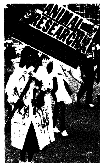
Bloody labs. An activist protests animal research.

If crafting a new, moderate face for the movement was the aim, however, nobody informed the assembled demonstrators. When actor Christopher Reeve told the crowd he supported the properly regulated use of animals in medical studies such as AIDS research, he was met with a chorus of boos. Reeve added: "If you want to get things done, the worst thing that can happen to