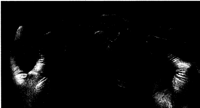
Hatchlings. From left, loggerhead, leatherback, and green turtles.