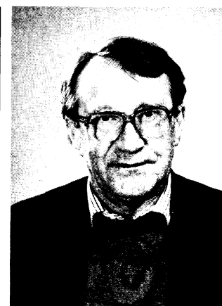
Roald Sagdeev. New U.S. professor.