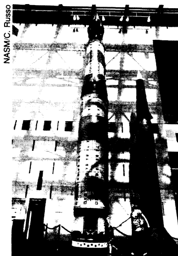
Missiles of yesteryear. Soviet SS-20 missile (left) side by side with a U.S. Pershing II.

missiles—including Soviet SS-20s and American Pershing IIs. Each nation gets to keep 15 of the other's "demilitarized" weapons.