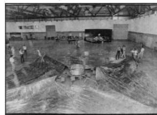
Half-scale prototype developed by World Space Foundation in 1981.

type—a 50-foot section of a sail 55 meters square—has been built by the privately-funded World Space Foundation in South Pasadena, California. Other designs include a disk-shaped, 560-foot-wide sail rimmed by 4-foot "petals," being promoted by a consortium led by the Johns Hopkins University Applied Physics Laboratory.