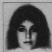
Faces of Eve. These four images are composites of 4, 8, 16, and 32 faces, respectively. The more the faces were “averaged,” the more attractive raters found them.