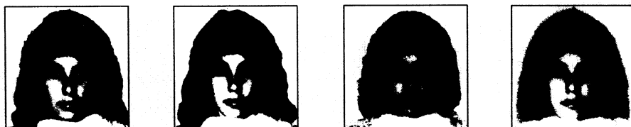
Faces of Eve. These four images are composites of 4, 8, 16, and 32 faces, respectively. The more the faces were “averaged,” the more attractive raters found them.

Organizations around the world—including the International AIDS Society which is co-sponsoring the Sixth International Conference on AIDS in San Francisco in June—have roundly criticized U.S. immigration policy for discriminating against persons with AIDS ( Science , 6 April, p. 26). The new waivers are “a positive step” says Chai Feldblum of the American Civil Liberties Union. But she believes a better step would be legislation introduced by Representative J. Roy Rowland (D-GA) that would permit AIDS to be removed from the list of contagious diseases that can be used to deny visas to foreign visitors.