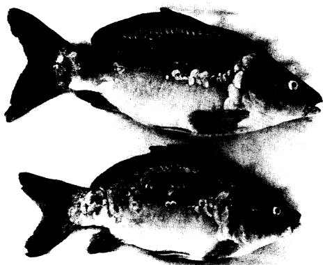
Enhanced fish. Carp carrying a trout growth hormone gene (top) grow larger than normal carp.

Stanford currently is charging companies with 75 or more employees a $50,000 sign-up fee, requires a $50,000 annual payment, and imposes a 2% royalty on end products that rely on patents held by the institution.