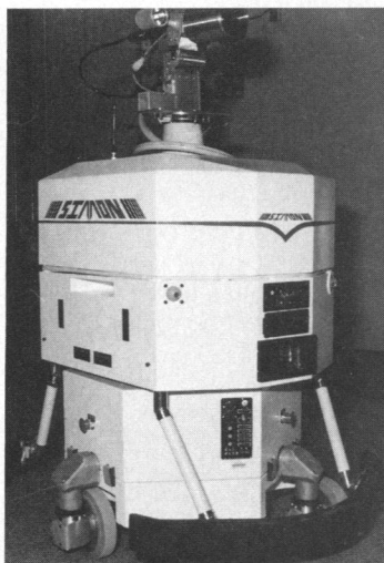
Savannah River Site