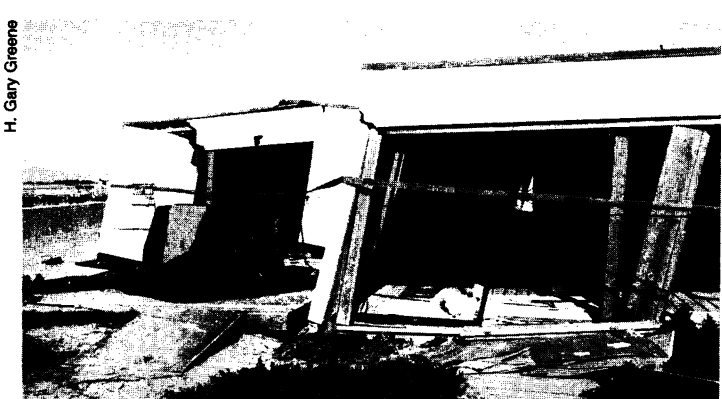
Main Building. Total loss.

History could have foretold Moss Landing's doom. The same sand spit suffered liquefaction during the great 1906 San Francisco earthquake as well as during more modest offshore quakes in 1926.