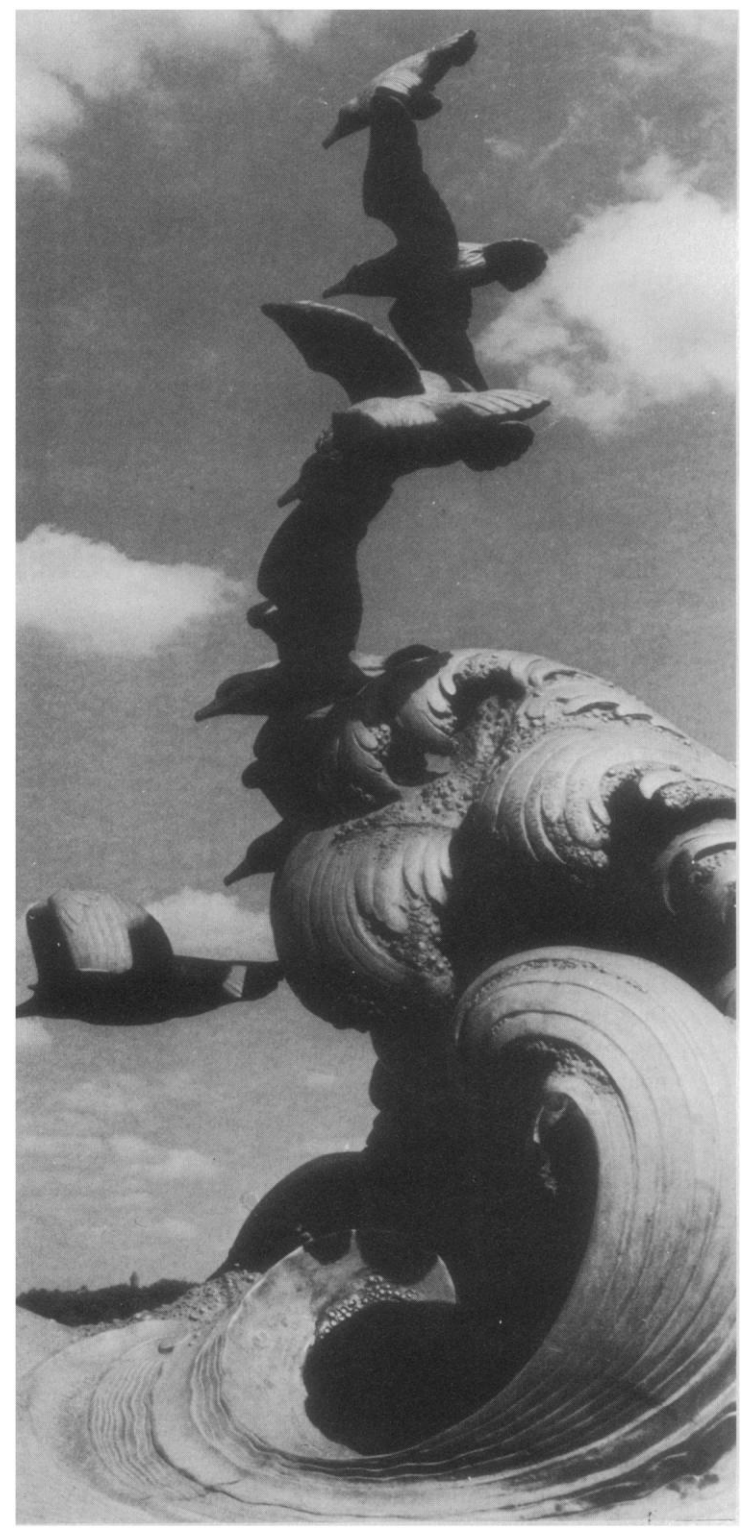
The Navy-Marine Memorial is considered one of the most handsome outdoor sculptures in the Washington, D.C., metropolitan area.