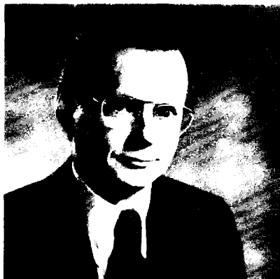
Governor Richard W. Riley

W. Riley of South Carolina. "We will not be successful in finding solutions to the problem of nuclear wastes unless federal, state, local, and tribal officials are prepared to work together on the assumption that agreements can be reached, not with the presumption that impasses are inevitable," says Governor Riley.