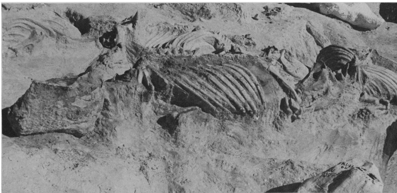
Fig. 1. Partially excavated Teleoceras skeletons. Heads are to left; limbs are flexed beneath bodies.

The fossils discussed in this report were part of a remarkable death assemblage of Miocene vertebrates discovered by M.R.V. in a 2-m-thick bed of pure volcanic ash in the Cap Rock Member (10) of the Ash Hollow Formation in the drainage basin of Verdigre Creek, Antelope County, northeastern Nebraska (11). The mammalian species in the assemblage indicate a late Clarendonian (12), approximately early late Miocene, burial. Numerous complete skeletons, mostly of T. major (13) but including those of horses, camels, and other animals (14), lie near the base of the ash, which appears to have accumulated very rapidly in a shallow body of standing water and to have buried the animals in the pond. Most of the Teleoceras skeletons are preserved three-dimensionally in what almost certainly are undisturbed death poses (Fig. 1). The former presence of standing water is shown by the symmetrically ripple-marked bedding planes of the ash bed as well as by the remains of aquatic turtles and diatoms in the ash.