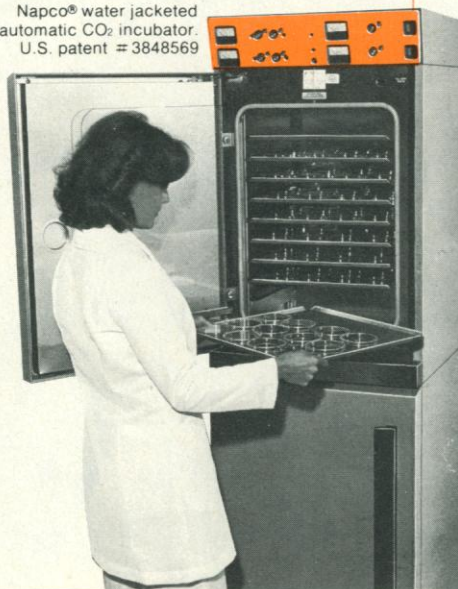
Napco® water jacketed automatic CO 2 incubator. U.S. patent #3848569

For accuracy and reliability, insist on the Napco 7000 models. They are the most advanced incubators on the market. Available in single or space saving vertical models. There's much more. Write for brochure.