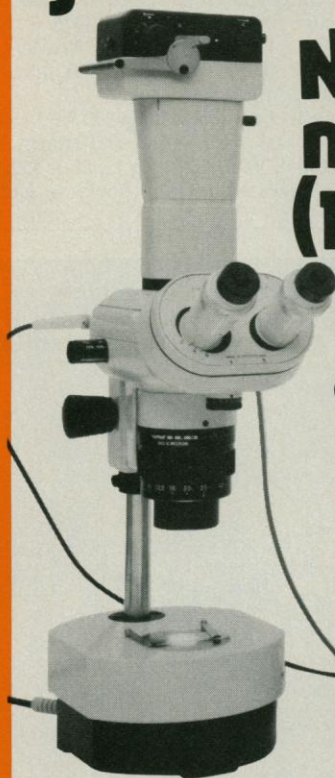
WILD M-400 PHOTOMAKROSKOP. The binocular automatic macro recording system, shown here with transmitted light illumination on darkfield / brightfield transillumination stand, with lens, and 35mm magazine.*

Now, take macro-range (1x to 20x) photos with automatic ease.