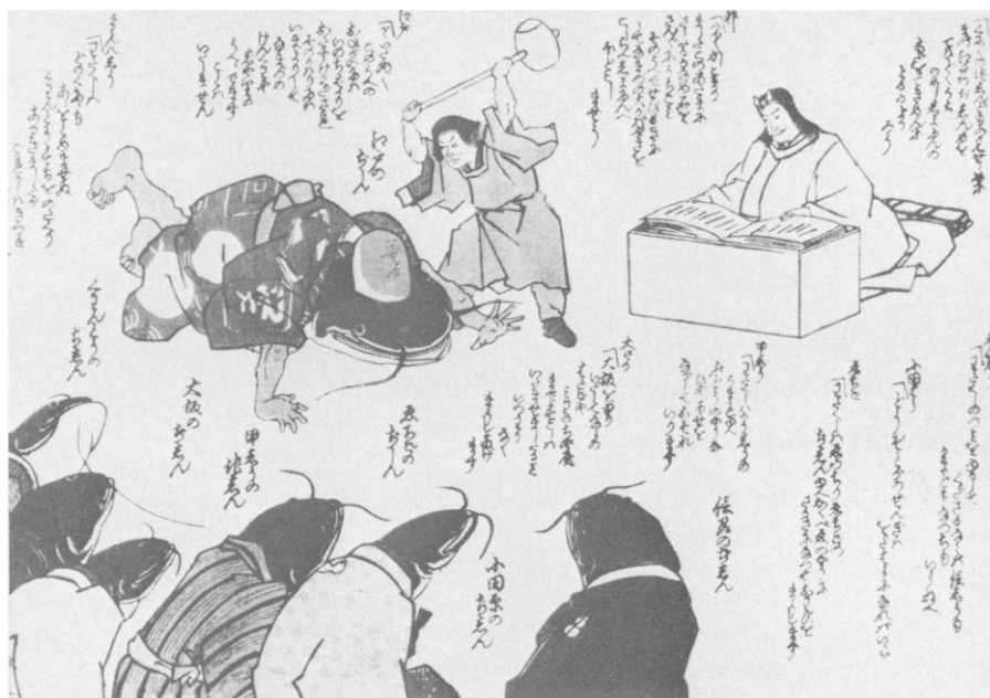
"The God-Superior from the Kashima shrine, Japan, tells the daimyoin to drive down the pivot stone hard on the Edo (Tokyo) earthquake namazu (catfish) to warn other earthquakes. Each of the onlooking namazu is a historical earthquake. From left, Kwanto, Osaka, Koshu, Echigo, Odawara, and Sado earthquakes." [From Earthquakes ]