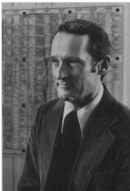
Seymour R. Cray

There are only seven or eight types of computers that have enough speed and memory capacity (generally 1 million words) to qualify as supercomputers. The biggest computer ever built by IBM (the 360/195) falls in the supercomputer class, but IBM sold only a few and has discontinued production of this model. Favoring instead the larger markets that