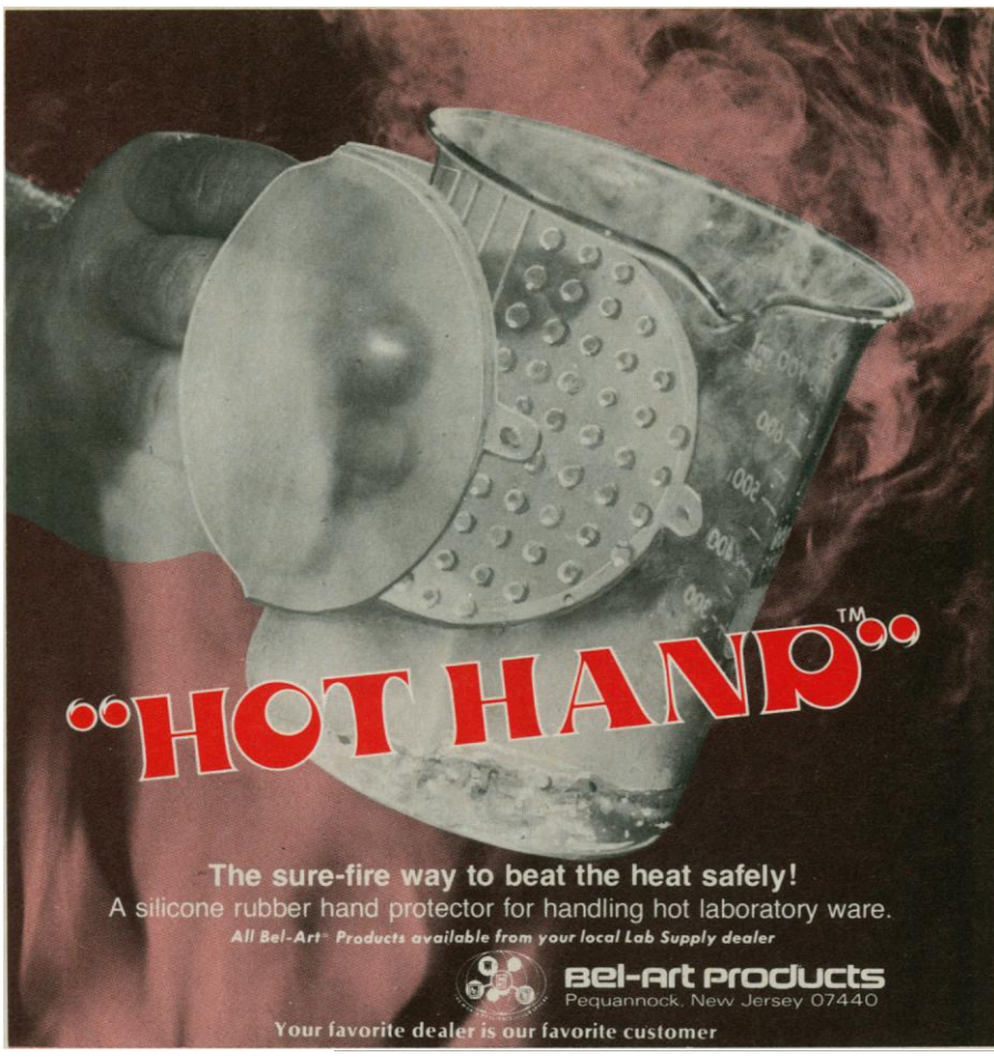
Circle No. 297 on Readers' Service Card

Values Tech. The Polytechnic School of Val-