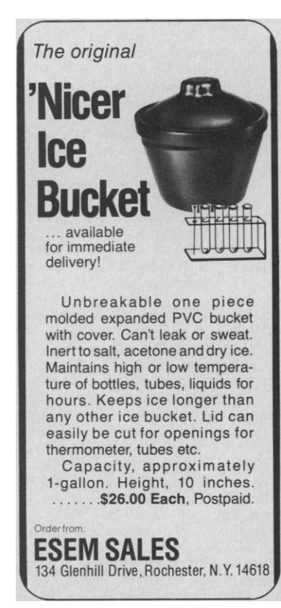
Circle No. 325 on Readers' Service Card