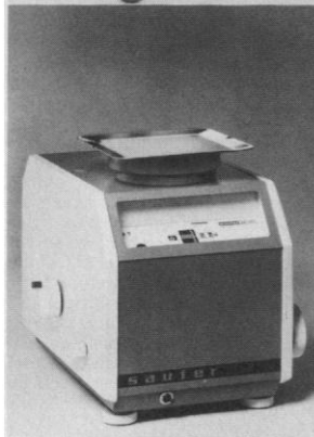
Precision Balance Type SM 1600