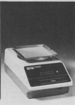
Electronic Precision Balance Type R 300/R 3000

SAUTER balances have earned a reputation for ease of operation, economy and practical technology. No wonder SAUTER balances are the choice in research and development laboratories, in industry and scientific institutions just about everywhere.