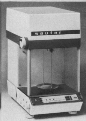
Analytical Balance Type 404/13