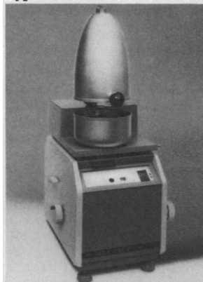
Precision Balance Type MPR