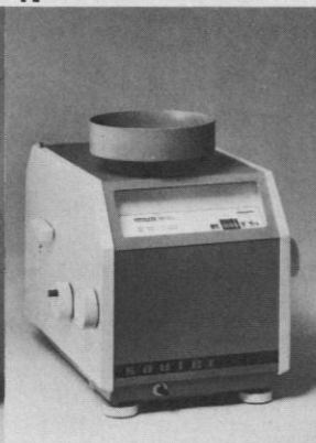
Precision Balance Type MM 160