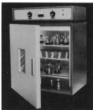
Biological bench-top incubator

Designed to meet the most stringent research requirements, this new CO 2 incubator provides a carefully controlled, high-humidity CO 2 environment. The unit has an 8½ cubic foot working chamber, yet needs little bench space. Temperature is electronically controlled from ambient to 70°C, and CO 2 tension is maintained from ambient to 20%. Other features include an automatic CO 2 recovery system, a visible water reservoir and a self-decontamination system. NBS manufactures a broad line of environmental chambers for incubation, humidification, refrigeration and controlled temperature shaking.