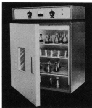
Biological bench-top incubator

Designed to meet the most stringent research requirements, this new CO 2 incubator provides a carefully controlled, high-humidity CO 2 environment. The unit has an 8½ cubic foot working chamber, yet needs little bench space. Temperature is electronically controlled from ambient to 70°C, and CO 2 tension is maintained from ambient to 20%. Other features include an automatic CO 2 recovery system, a visible water reservoir and a self-decontamination system. NBS manufactures a broad line of environmental chambers for incubation, humidification, refrigeration and controlled temperature shaking.