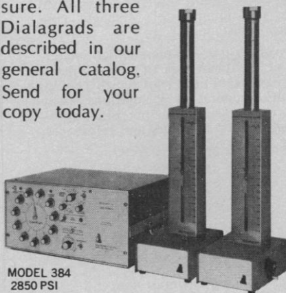
MODEL 384 2850 PSI

The entire gradient program is determined with directly calibrated dial controls—no cams to cut, no multiple solutions to mix, no manual calibration of external pumps. Dial-set multiple straight line programming is not limited to simple curves and greatly simplifies experimental changes to obtain optimum separations. Dial values are easily recorded and communicated to others. The desired curve is perfectly reproduced by individual pumps which proportion each component under pressure. All three Dialgrads are described in our general catalog. Send for your copy today.