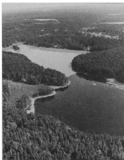
Fig. 1. Lake 226, demonstrating the vital role of phosphorus in eutrophication. The far basin, fertilized with phosphorus, nitrogen, and carbon, was covered by an algal bloom within 2 months. No increases in algae or species changes were observed in the near basin, which received similar quantities of nitrogen and carbon but no phosphorus.

In an early experiment, phosphate and nitrate were added to lake 227,