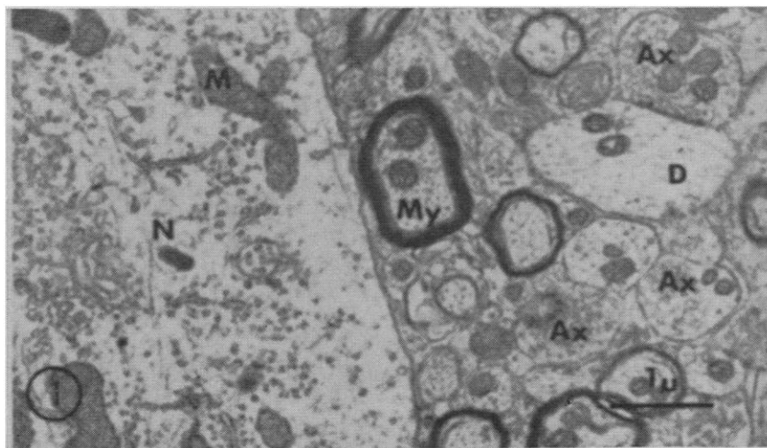
Fig. 1. Neuron (N) and neuropil of the lateral preoptic nucleus in an MSG-treated adult rat. Ax, axon terminal; D, dendrite; M, mitochondrion; My, myelinated axon ( \times 16,300 ).

* The difference from the value for the control group is significant at the P < .01 level.