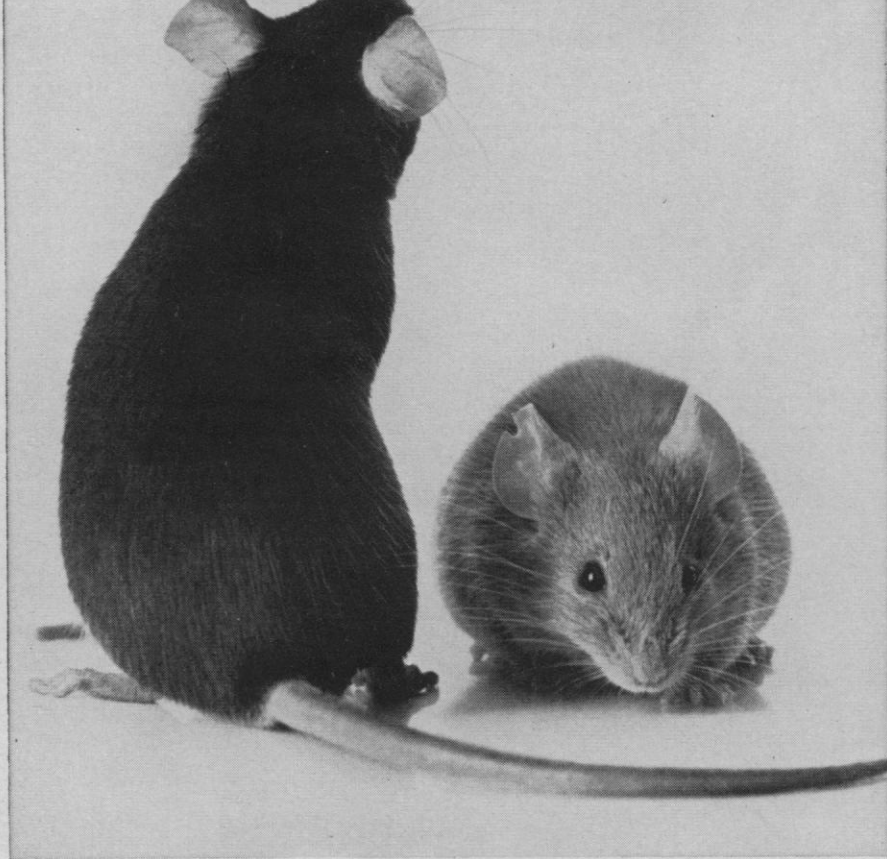
Circle No. 27 on Readers' Service Card