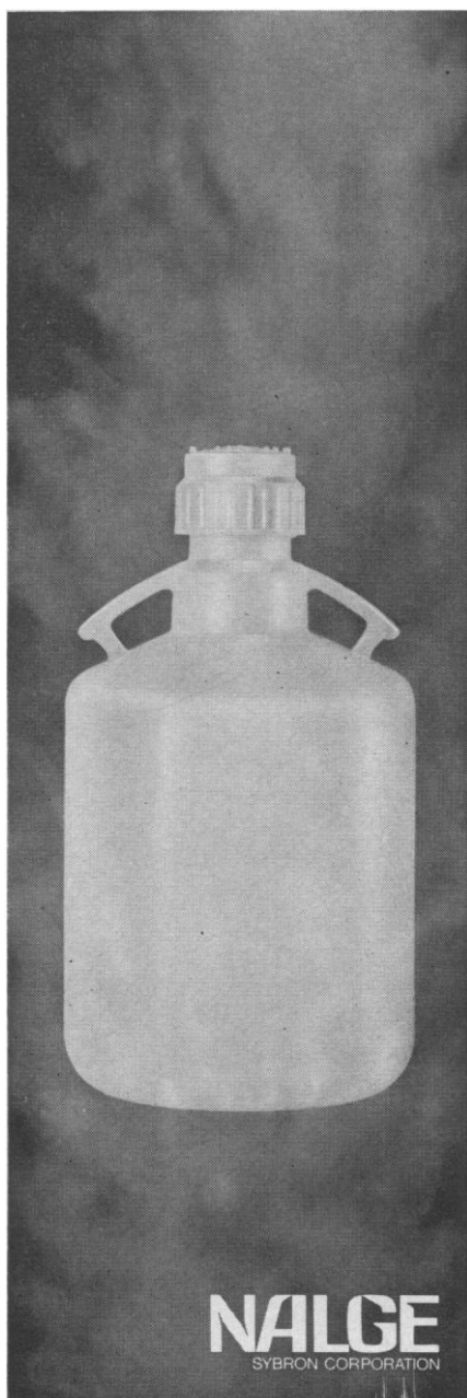
Circle No. 88 on Readers' Service Card on page 110A

Specify Nalgene Labware from your lab supply dealer. Ask for our Catalog or write Dept. 2107, Nalgene Labware Division, Rochester, N.Y. 14602.