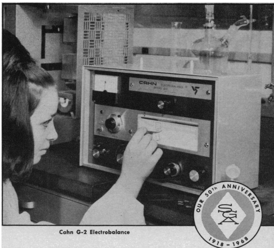
Cahn G-2 Electrobalance