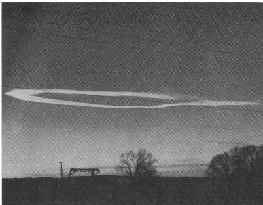
Fig. 1. Stratospheric cloud over Flagstaff, Arizona, from a point about 160 miles east-southeast, after sunset. The dark clouds in the west are cirrus clouds on which the sun has already set.

By fortunate coincidence, the cloud appeared within a few tens of miles of the U.S. Weather Bureau radiosonde station at Winslow, Arizona, and a high-altitude sounding had been completed there only an hour before the appearance of the cloud. A jet stream lay almost directly under the cloud and over Flagstaff, and there were peak winds of 98 knots from the northwest occurring over Winslow at an altitude of about 11 kilometers. The radiosonde run terminated at the 13-millibar level of atmospheric pressure (about 29 km), where the temperature was -46^{\circ}\text{C} . There was very little direction shear in the Winslow wind sounding, a condition known to favor formation of mountain waves and believed to be conducive to nacreous clouds, at least in Scandinavia (2). It is possible, therefore, that the San Francisco Peaks just north of Flagstaff disturbed the flow so that wave motion was set up in the stratosphere, but this remains a conjecture, pending further study of reports of first appearance. Whereas