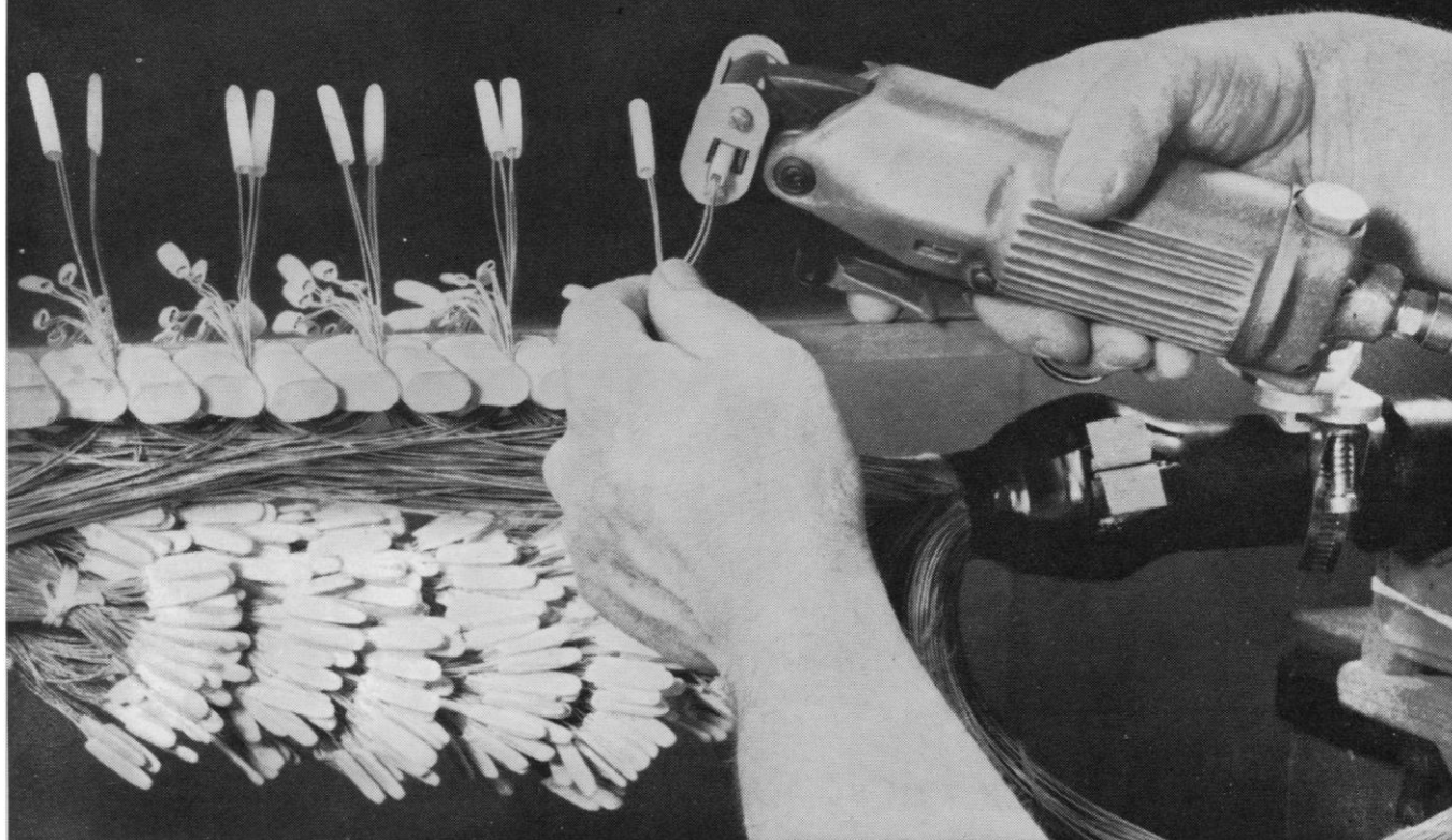
Telephone craftsman uses special pneumatic tool to flatten connector onto insulated wires. Metal tangs pierce insulation and produce a splice that is equivalent to a soldered joint.

Along the cable routes of the Bell System, wires are spliced at a rate of 250,000,000 a year. Conventionally, connections are made by "skinning" the insulation, twisting the bare wires together, and slipping on an insulating sleeve. Now, with a new connector initiated at Bell Telephone Laboratories, (diagram at lower right) splices can be made faster, yet are even more reliable.